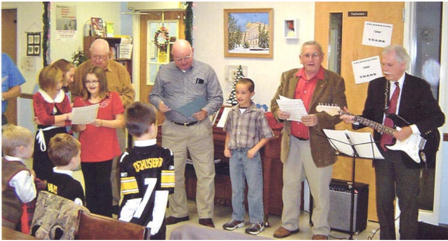
The Warfordsburg Troubadours