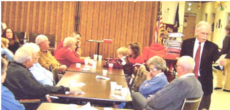
District 14 - L Party Lions at Warfordsburg