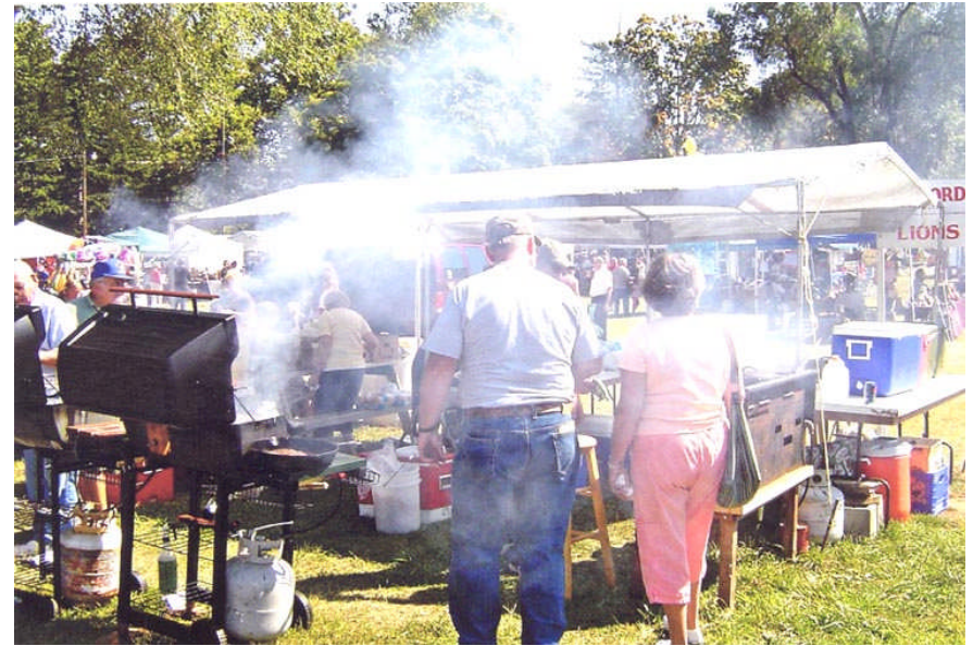
If it isn't a PDG, it's a grill blowing smoke! Warfordsburg at work at Canal Days.