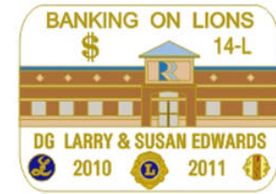
District Governor Personal Pin