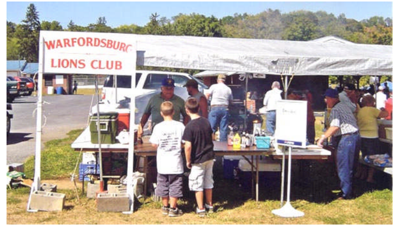
Warfordsburg Lions Canal Days Project