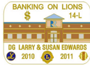
District Governor Personal Pin