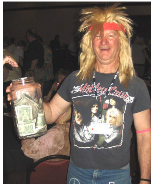
At the PA Lions State Convention, the Hippie had to pay royalty to Larry the Cable Guy for using "Gitter Done" as a slogan. The royalty was donated to LCIF.