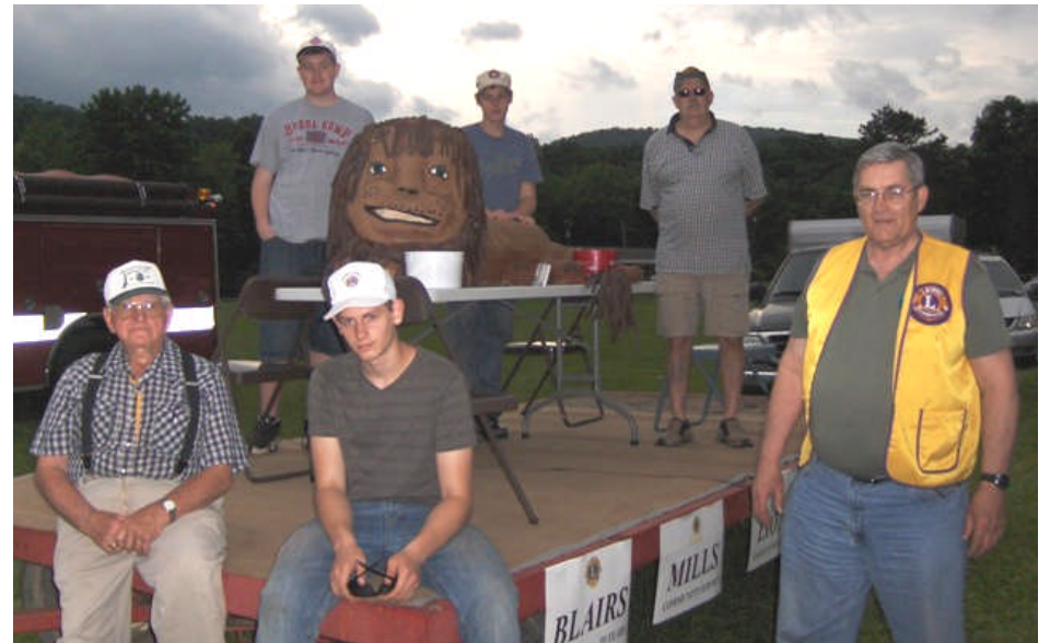
The happiest Lion in District 14 - L. He got to ride the Blairs Mills Lions Club Float in the East Waterford Parade