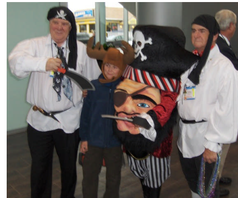
The Tampa Bay Pirates take hostages for the 2012 Forum

If you do not file the 990N for three consecutive years, you will lose your IRS Tax exempt status and your club receipts will become taxable as a for-profit business.