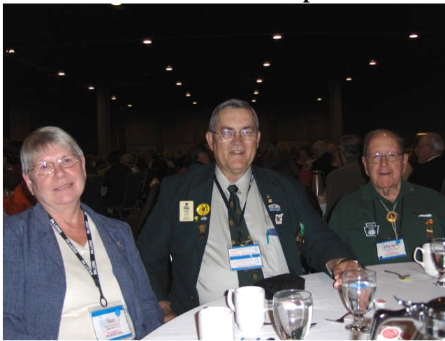
District 14 L at the USA Canada Forum in Anchorage