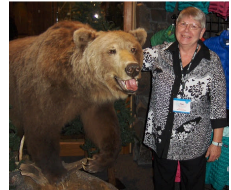
Don't mess with Lion Sue - the bear lost!