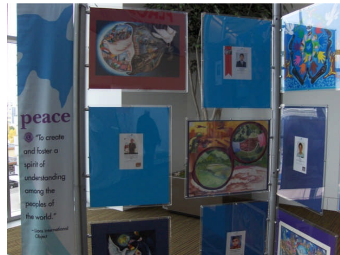
Peace Poster Winners on display at the Forum