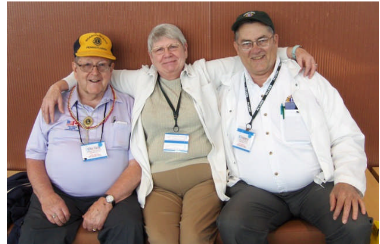
The 14 L Crew - Informal